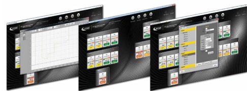
DEGA VISIO III visualization software