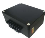
Mounting Box for Zener Barriers with DIN rail