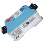
Intrinsic safety Zener barrier