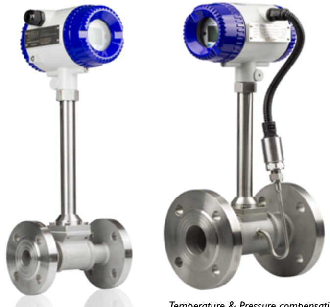
Temperature & Pressure compensation